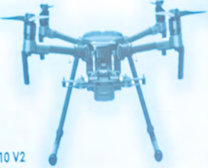
DJI Matrice 210 V2

sees detects and avoids obstacles in location of nearby airplanes and helicopters